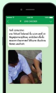
Class teachers / Infirmary teachers