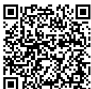
Tuition Fee Payment Form