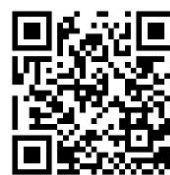
Proof of payment