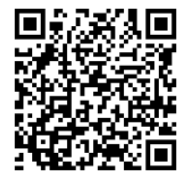
Online Request Form